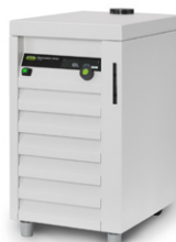
Recirculating Chiller F-305 / F-308 / F-314 The efficient and water saving way of cooling