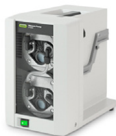
Vacuum Pump V-300 The economical and silent vacuum source