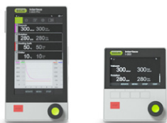
Interface I-300 / I-300 Pro Convenient process regulation and monitoring