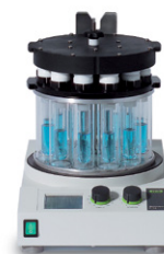
Multivapor™ P-6 / P-12 Efficient evaporation for multiple samples