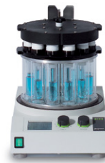
Multivapor™ P-6 / P-12 Efficient evaporation for multiple samples