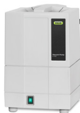
Vacuum Pump V-100 Economical vacuum source