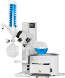
Rotavapor® R-100 Economical evaporation