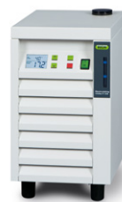
Recirculating Chiller F-100 / F-105 The easy way of cooling