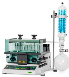
Syncore® Polyvap Multiple sample workup