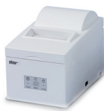
Star Printer Serial printer