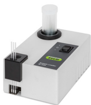
Sample Loader M-569 Efficient packing of capillaries