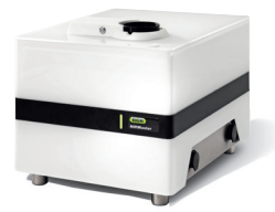
NIRMaster™ IP54 FT-NIR spectroscopy with ingress protection